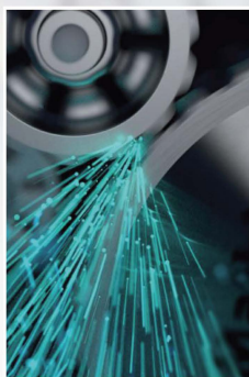
Hidden fire source search