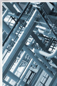
Heating equipment inspection