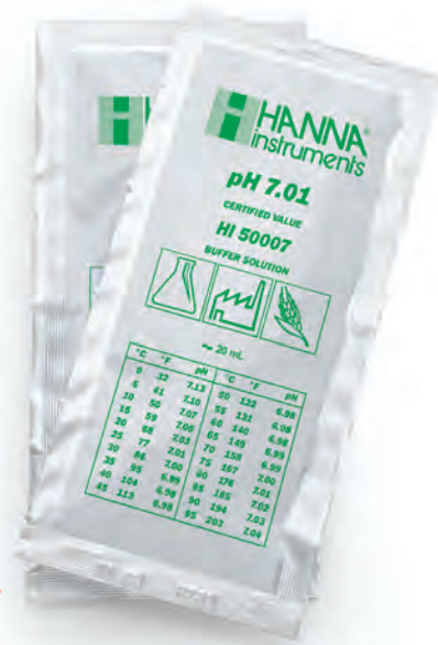
Table of Reference Temperatures

HI5000 calibration solutions are provided with a label presenting a reference table of the relationship between pH or conductivity values and temperature.