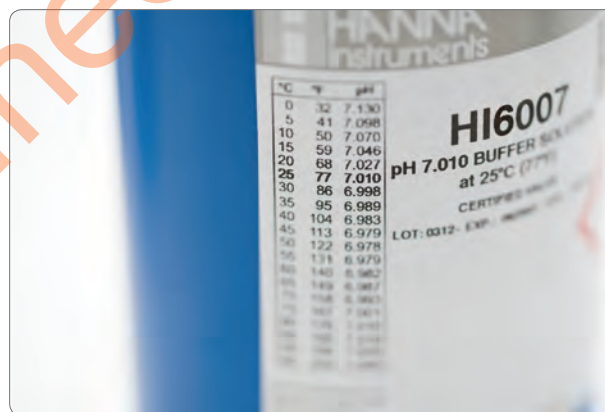
Table of Reference Temperatures

HI6000 calibration solutions are provided with a label presenting a reference table of the relationship between pH or conductivity values and temperature.