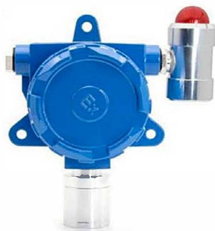
With sound and light alarm