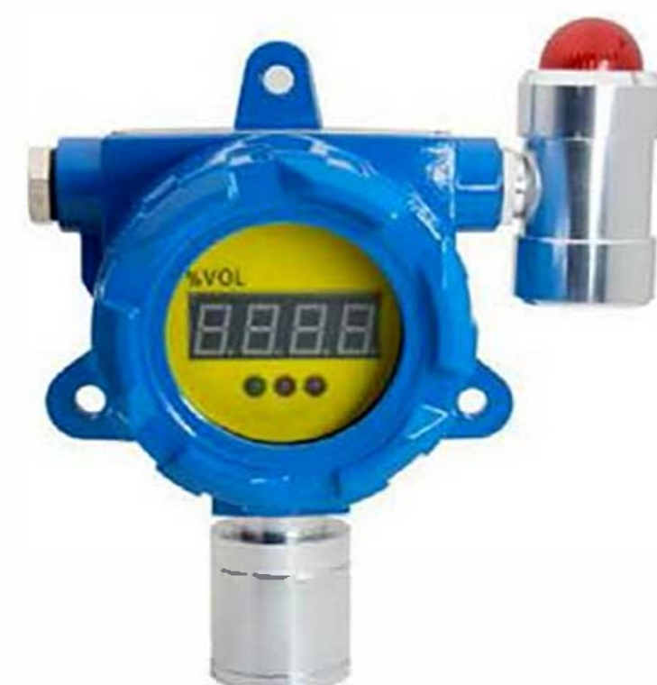
With sound,light alarm and LED display

Bosean established in 2013. over more than 5 years development, now ranked top enterprise in instrument measurement line that integrates independent research , design, production and sales of gas detection instruments, laser ranging instruments and other testing products. Our products widely used in individuals, families and businesses, and get wide range approval .