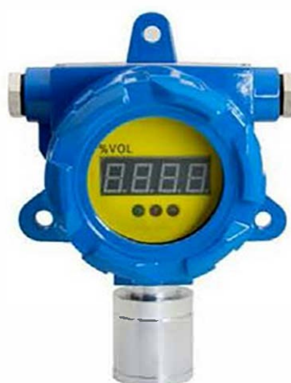
With LED display